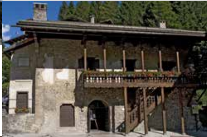
Pieve di Cadore, Casa del Tiziano