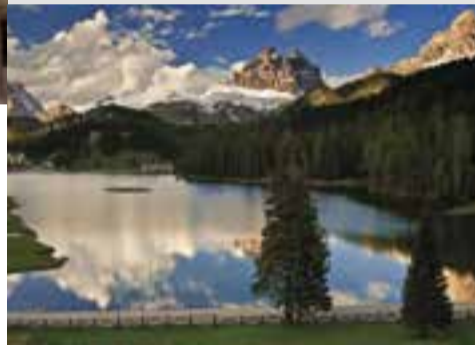
Misurina lake

The itinerary starts from Pieve di Cadore , the main historical centre of the whole valley. Inside the central Piazza Tiziano the following is worth a visit: S. Maria Nascente church ( Madonna con Bambino e santi by Tiziano and Bottega and other works by Francesco and Cesare Vecellio), the seat of the "magnifica comunità di cadore", a fourteenth century building which houses the civic archaeological museum, and finally the birthplace of the painter Tiziano.