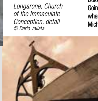
Longarone, Church of the Immaculate Conception, detail

Finally, going back up towards the Boite Valley, you will find the villages of Vodo di Cadore (Church of Vinigo, national monument), Borca di Cadore (church of Saints Simone and Taddeo with Callido organ and Our Lady of Cadore Church in ENI Village) and San Vito di Cadore . Definitely worth a visit is the fourteenth century Beata Vergine della Difesa church in San Vito. A couple of kilometres away, in only a few minutes, the Queen will grant you an audience with her, and once again you will be back to Cortina.