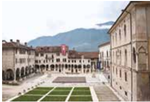
Feltre, piazza Maggiore