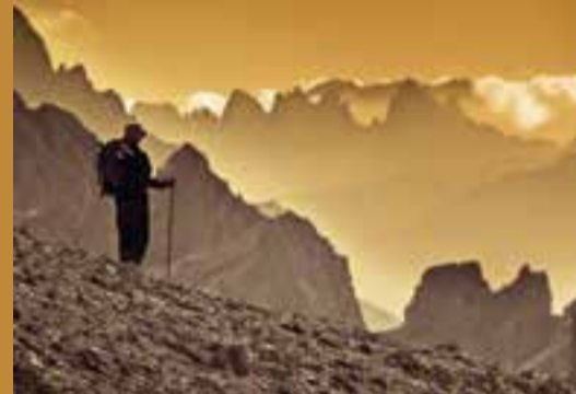
Dolomiti

In the province of Belluno, there is the greatest number of Dolomites peaks, according to UNESCO's Natural Heritage of Humanity, with legendary peaks such as Marmolada, Tofane, Antelao, Pelmo, Civetta, Pale di San Lucano, Schiara and Tre Cime di Lavaredo.