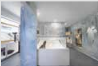
© Museum of the Great War 3000