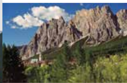
Cortina d'Ampezzo

Cortina d'Ampezzo is the queen of the Dolomites. This is thanks to its geographical position in a splendid valley with Tofane and Cristallo to the north, Sorapiss and Antelao to the south-east and Croda da Lago to the south-west. Situated in the heart of the Dolomites, the Ampezzo basin is unique for its history, a home point for climbers and skiers and international scene of the high-life but also a place where you can discover people and culture. It is a city which offers you at the same time the bright lights of the shops but also the authentic possibility to discover the Ladine culture.