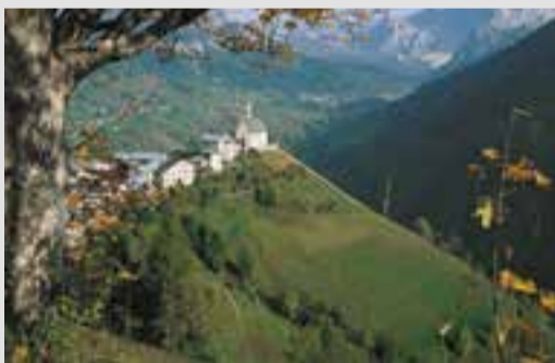
Colle Santa Lucia

And then Pieve di Livinallongo , with its Ladine Museum; a little further on there is Arabba , at the foot of the imposing Sella mountain range, then, and in the direction of Cortina, take a detour to the fortress of Andraz , an old fortified castle dating back to the XI Century. Keep going on and you will reach the viewpoint of Passo Falzarego where you will reach at the end the bright valley of Ampezzo.